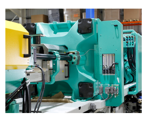
Motorized Clamping Tool

SSRs are preferred over their electromechanical counterparts because of their extended lifetime, resistance to shock and vibration, and fast switching.