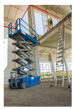
Slab (battery-powered) scissor lift

Sensata can also supply a complete set of main sensors: the high-pressure sensor (PTE series) that controls the hydraulic pressure of the main cylinder, the angle sensor (9360 Series) used to determine the height of the platform, and the inclinometer (T series or other) to control the chassis inclination for safety reasons. The pressure and angle sensor used in combination are also aimed to control the platform overload condition, which is required to comply with ANSI 92 and EN280 safety standards.