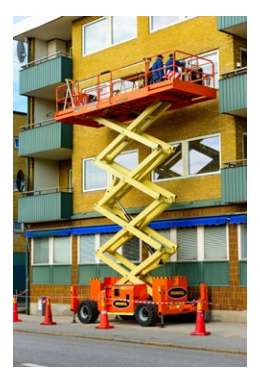
Rough Terrain (engine-powered) scissor lift

"All functions and movements are controlled using Sensata's platform control systems and sensors to guarantee compliance with international safety standards"