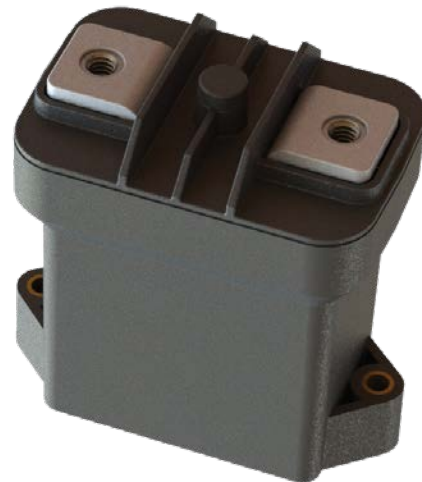
The GigaFuse from GIGAVAC is a fast-acting device that trips circuits at exact, specified currents.

Available in both passive and passive/active combinations, this device uses the magnetic field of the current, the Lorentz force, to trigger the device to open. Figure 3 shows an example of how the GigaFuse operates, with the blue line representing the triggering threshold, showing that the device can open the circuit faster than a fuse and closer to the desired operating conditions. The triggering threshold's path can be adjusted, based on the construction of the circuit-tripping device.