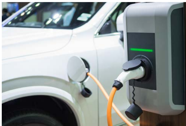
Advanced energy systems demand advanced power storage solutions.

The higher cell densities in advanced battery systems demand proper safety protocols and devices as the power levels involved present a significant challenge when it comes to managing short circuits. To create a